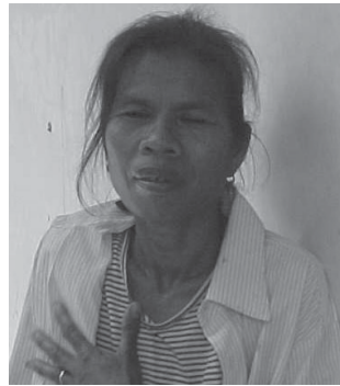
This chieftain's wife was instantly healed when her husband entered into covenant with the Creator God.